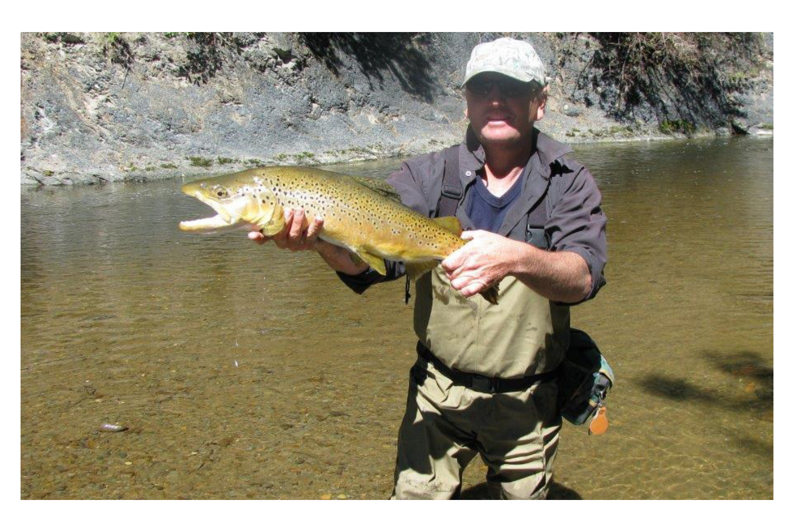
Above: an average brown. Below: an average rainbow.