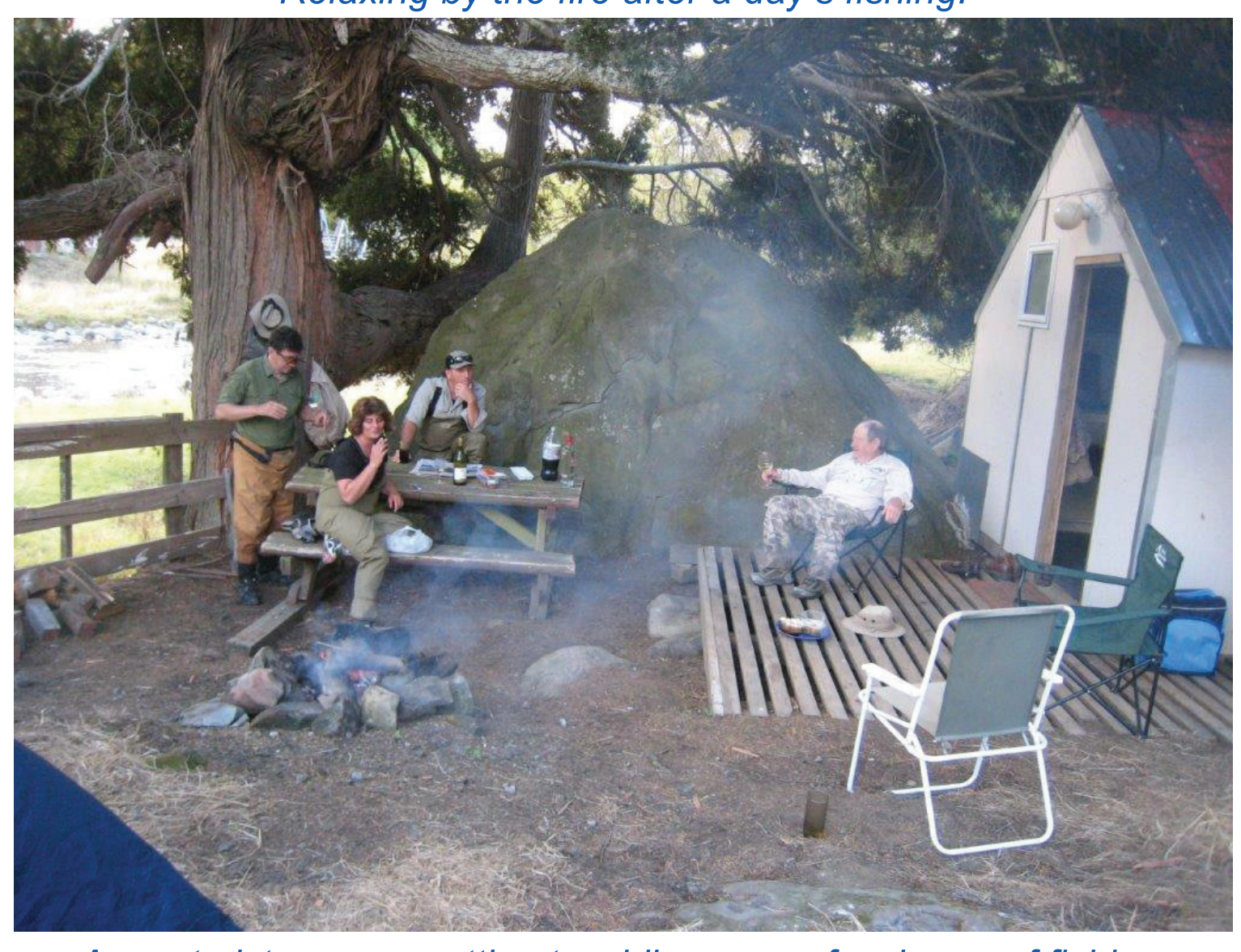
A most picturesque setting to while away a few hours of fishing.